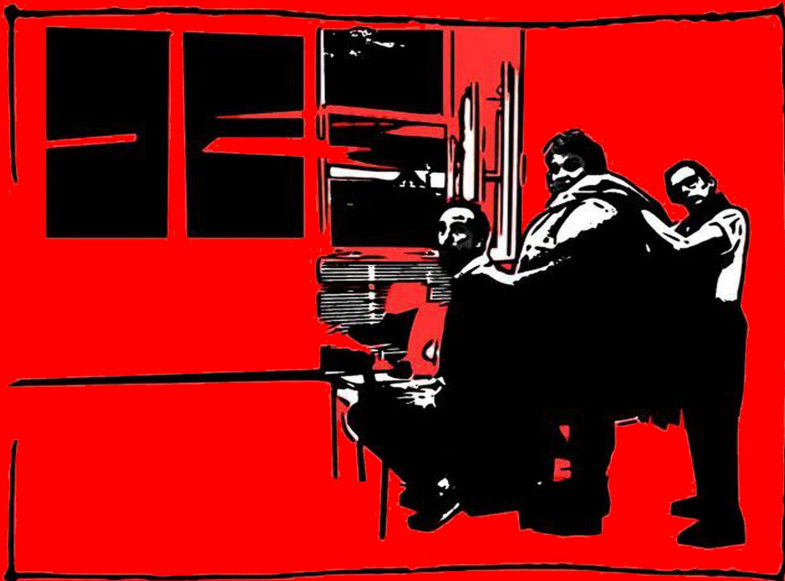
Short breaks between sessions are always good for different kind of activities. Group massage, for example :)

The phenomenon of mobility, in conjunction with the evolution of the means of communication and transport, transforms our way of life and contributes to the formation of "horizontal identities". As the writer Amin Maalouf suggests: "Things have changed so much in a few years that we feel infinitely closer to our contemporaries than to our ancestors. Would I be exaggerating if I said that I have more in common with a passer-by chosen at random in a street of Prague, Seoul, San Francisco or Barcelona, than with my own grandfather? Not only because of appearance, clothes, habitat or tools that surround us but also because of moral concepts, ways of thinking. And also because of beliefs. (...) In short, each of us is the deposit of two inheritances: one, "vertical", comes from our ancestors, the tradition of our village, of our religious community; the other, "horizontal", comes from our time, our contemporaries. It is the latter which, in my view, is more determining, and is more so each day that goes by."